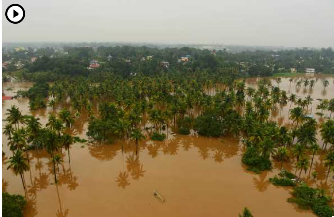
Kerala floods: Air Force drops relief materials in flood-hit regions