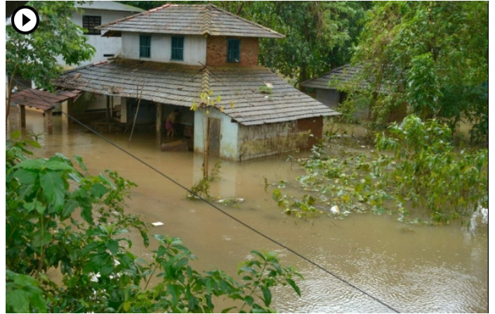
More rains likely in Kerala as flood death toll jumps